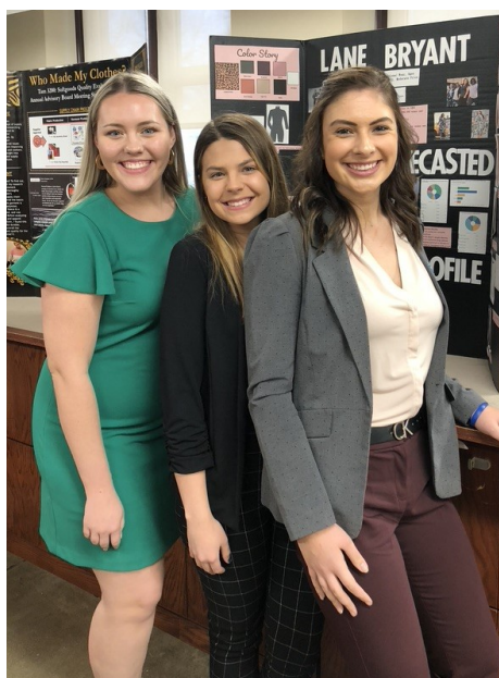
Pictured: TAM students presenting their work