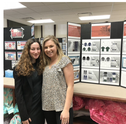
Pictured: TAM students presenting their work