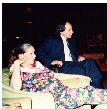
1992-Advisory Board Meeting with Owner of Bingham's