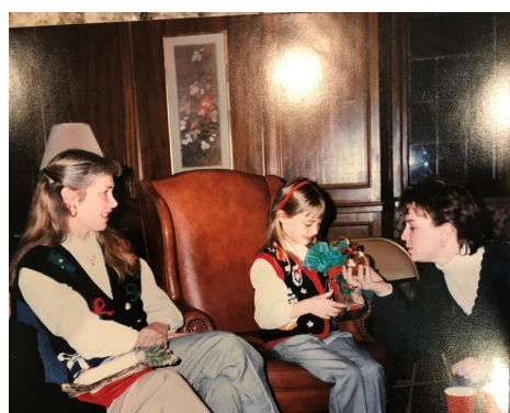
1994-At an ATAM Christmas Party with her daughter