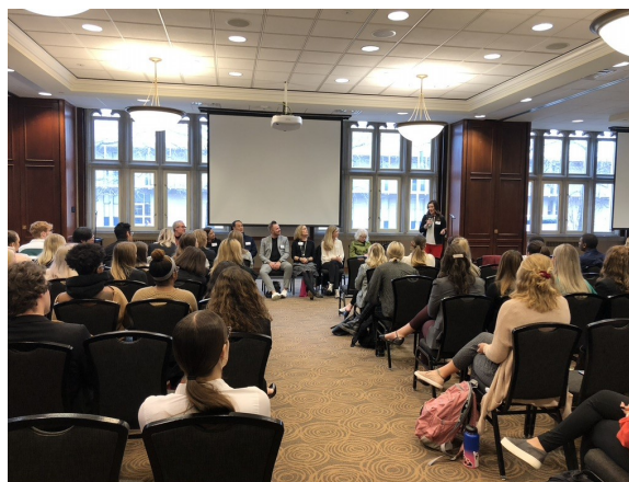
Guest speakers during the Advisory Board