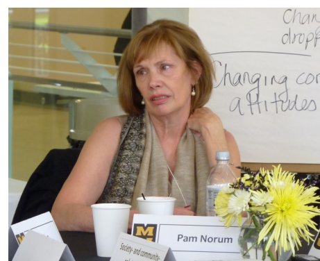
2012-Textile Labeling Summit